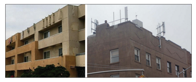
Figure 4. Photos show two examples of using cellular antennae that do not consider the safety guidelines (IEEE, 2006; FCC, 1997; ICNIRP, 1998) and distort the landscape.

i.e., cost, visual pollution, limited free spaces, and getting license. Thus, the alternative solution is to install the cellular antenna on the roofs of buildings, schools, hospitals, and even houses, Figure 4. Consequently, this increases the visual pollution and the possible biological effect, as well.