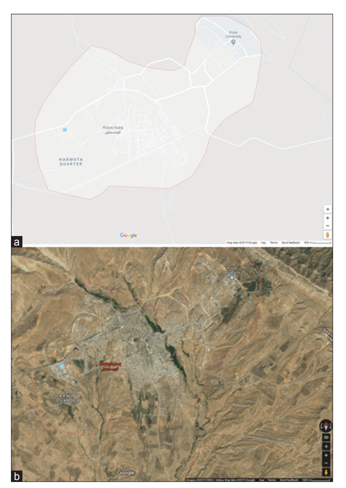
Figure 6. Google map of Koya city; (a) plain map, (b) Terrain map showing the residential and business areas. Captured on April 17, 2019