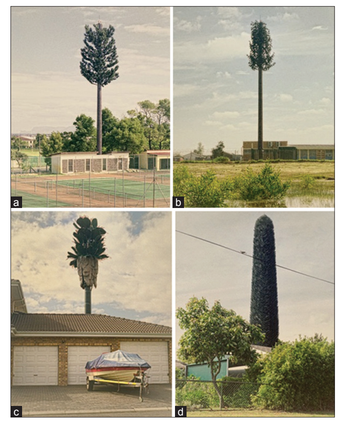
Figure 5. Photos of different applicable shapes of tree cell phone towers, photographer Dillon Marsh, 2009. http://petapixel.com/2013/06/06/ photos-of-cell-phone-towers-disguised-as-fake-trees

A study in India (Kumar, 2010) showed that the majority of cell phone operators use 2–12 carrier frequencies (average maybe around 6) and they transmit 20 W of power per carrier. Hence, one operator may be transmitting nearly 100 W of RF power depending on the number of carriers. There may be 2–3 operators on the same roof-top or tower; thereby total transmitted power may be 200–400 W. In addition, the majority of them use directional antennas of gain=18 dB. Assuming 1 dB cable loss, effective gain=17 dB (numeric value is 50), so effectively, several KW of power may be transmitted in the direction of the main beam. Several KW of EMF emitted by cellular antennas installed in the vicinity of human bodies in buildings, schools, hospitals, et al., makes the possible biological effect a major concern.