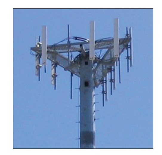
Figure 2. Top of a cellular radio tower. Nine sector antennae of three operators, three per one operator. http://en.wikipedia.org/wiki/Cellular_ network